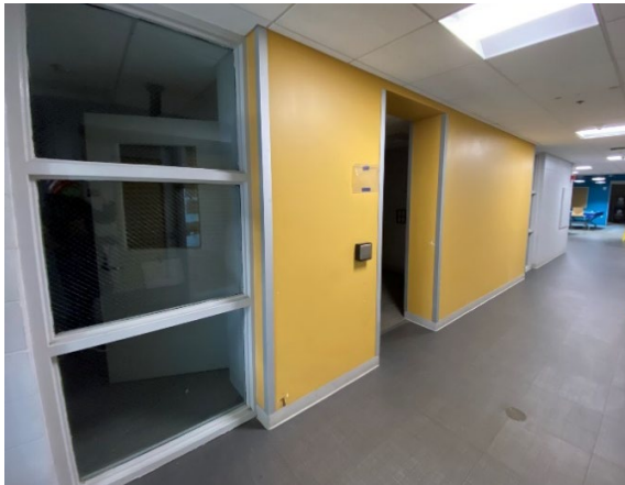
H-Wing Corridor Prior to Start of Renovation