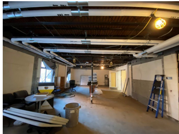
Future Exercise Room, H-Wing