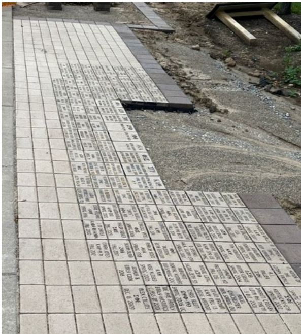
Newly installed pavers