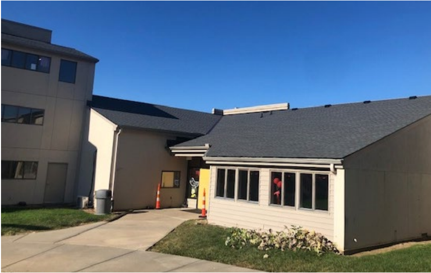
Commonwealth Hall - September 28, 2022