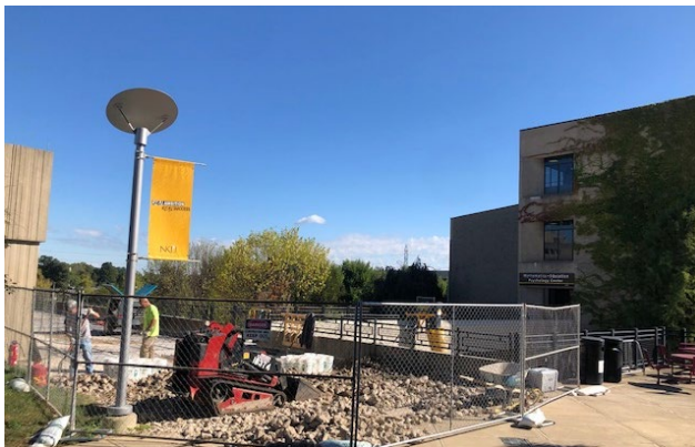
September 28, 2022