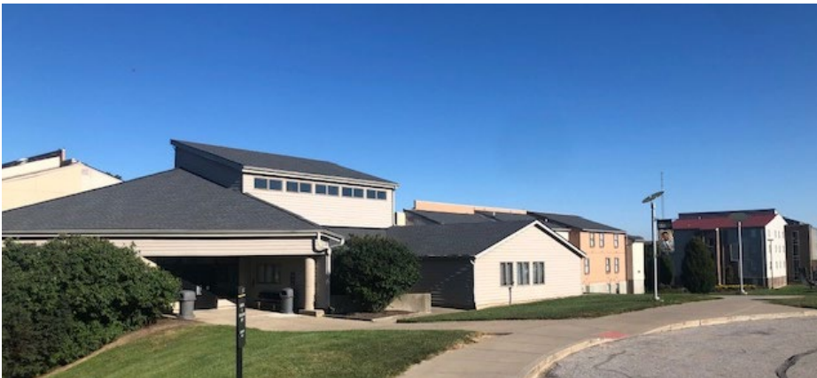
Kentucky Hall - September 28, 2022